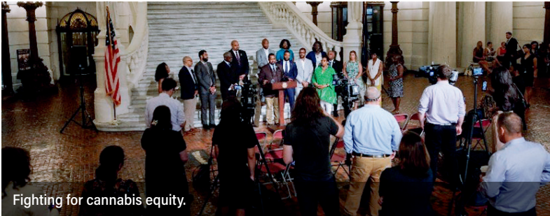
Fighting for cannabis equity.

There are far too many people incarcerated who have served their time, shown that they have been reformed, and are not a danger to society. I have reintroduced Senate Bill 135 which would make it possible for those sentenced to life imprisonment to eventually have an opportunity to be reviewed for parole in Pennsylvania. Pennsylvania has over 5,250 people serving a life sentence in our state prison system – more than all but one other state in the country. I am proud to advocate for legislation that allows for people to get a second chance in life.