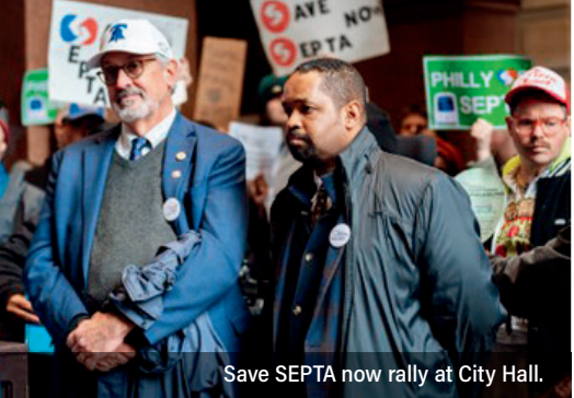
Save SEPTA now rally at City Hall.

Students, workers, families, and visitors make up the more than 700,000 people who rely on SEPTA. I stand with those who want to see SEPTA funded properly so that the buses, trains, and trolleys can operate safely and reliably to get people where they need to go.