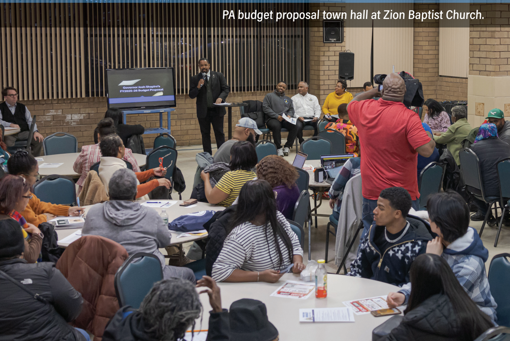
PA budget proposal town hall at Zion Baptist Church.

INSIDE: MAINTAINING HEALTH & WELLNESS | IN THE COMMUNITY | FIGHTING FOOD INSECURITY BUILDING BUSINESSES AND SAFER STREETS | INVESTING IN CRIMINAL JUSTICE REFORM KNOW YOUR RIGHTS