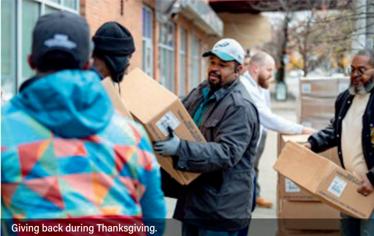
Giving back during Thanksgiving.

My office will continue to work to get you the money that is rightfully yours.