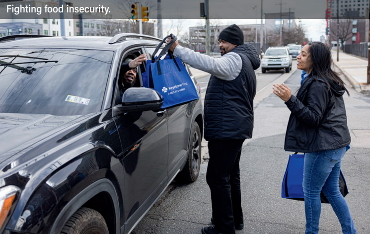
Fighting food insecurity.

For more than 25 years I've had the pleasure of giving back to organizations and those in need during the Thanksgiving season. Started by my father in 1980s I now team up with Nicetown CDC to distribute thousands of turkeys in Philadelphia and throughout the Commonwealth of Pennsylvania.