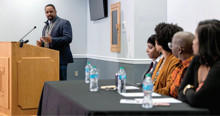
Senator Street with women business owners during the Women in Wellness panel on International Women's Day.

Since November 2024 my office has prioritized creating programming that highlights ways to work on mental health and wellness daily. Working with various health practitioners and community organizations we are working to break stigmas and provide tools to improve the wellbeing of our community.